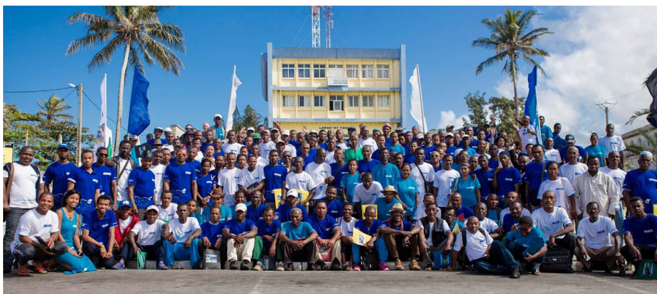
Forum National MIHARI 2017

Territories of life that are governed and managed by communities sometimes have special status as ‘community protected/conserved areas’. They can comprise forests, lakes, rangelands, watersheds, mangroves, marine areas or collective cultural properties in territories of life, according to a Malagasy legislation called GELOSE (literally: legislation to Secure Local Management). Sometimes they are part of larger state-run marine or terrestrial protected areas. A typical GELOSE contract transfers management authority to a VOI (formal community organization) for a relatively short period of time and is accompanied by maps of the land and its resources. A simple development and management plan usually sets out what is permitted in each zone: in a core area, entry is permitted only for rituals; in another zone, only traditional uses are allowed; in yet another area, there can be only regulated cultivation or fishing; etc. Sometimes, conditions are set for the quantity and schedule for timber or fish harvesting and the role of diverse stakeholders.